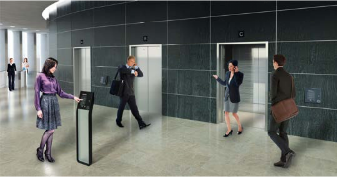
The KSP 858 touchscreen destination operating panel is also available with a pedestal matching the design of the operating panel. This makes it possible to place the DOP away from the crowded door entrance area to further improve lobby traffic.