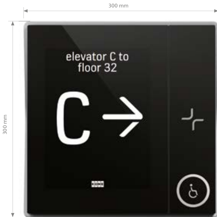
10.4" capacitive touchscreen with high-quality glass faceplate